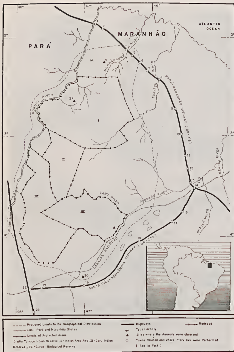
Figure 2. The proposed limits of the geographical distribution of Cebus kaapori sp.n., the type locality and site where the animals were seen and observed. The protected areas within the geographical distribution are also shown, as well as the highways, roads and railroad and the places where interviews were performed (numbered as follows): 1-Gurupi; 2-Quatro Bocas; 3-Maraçumé; 4-Garimpo Limão; 5-Encruzo; 6-Maranhãozinho; 7-Bela Vista; 8-Santa Luzia do Pará; 9-Nova Olinda; 10-Araguanã; 11-Zé Doca; 12-Chapéu de Couro; 13-Bom Jardim; 14-Santa Inês; 15-Pindaré Mirim; 16-Santa Luzia; 17-Floresta; 18-Santo Onofre; 19-Burititupu; 20-Fazenda Varig; 21-Piquiá; 22-Açailândia; 23-Imperatriz and 24-Gurupiuna Village.